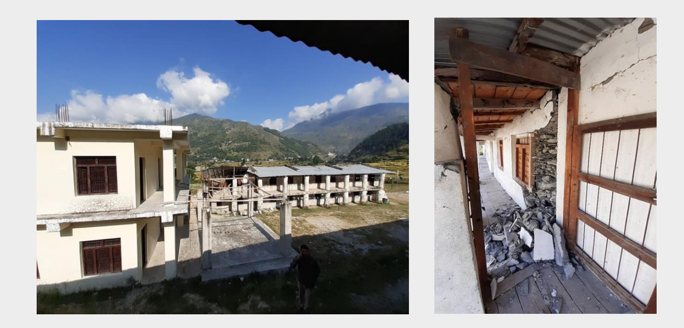
Bal Bikash Secondary School, Golai, JayPrithvi Municipality-4, Bajhang