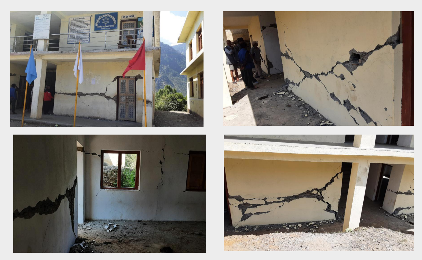
Sunikot Higher Secondary School, Talkot-1 Bajhang